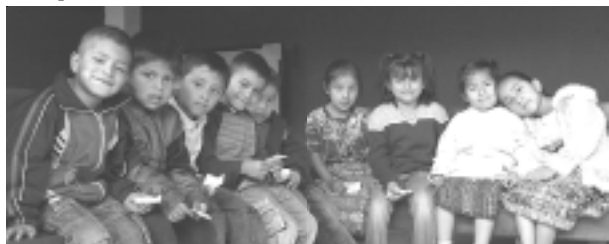
The children of Guatamala